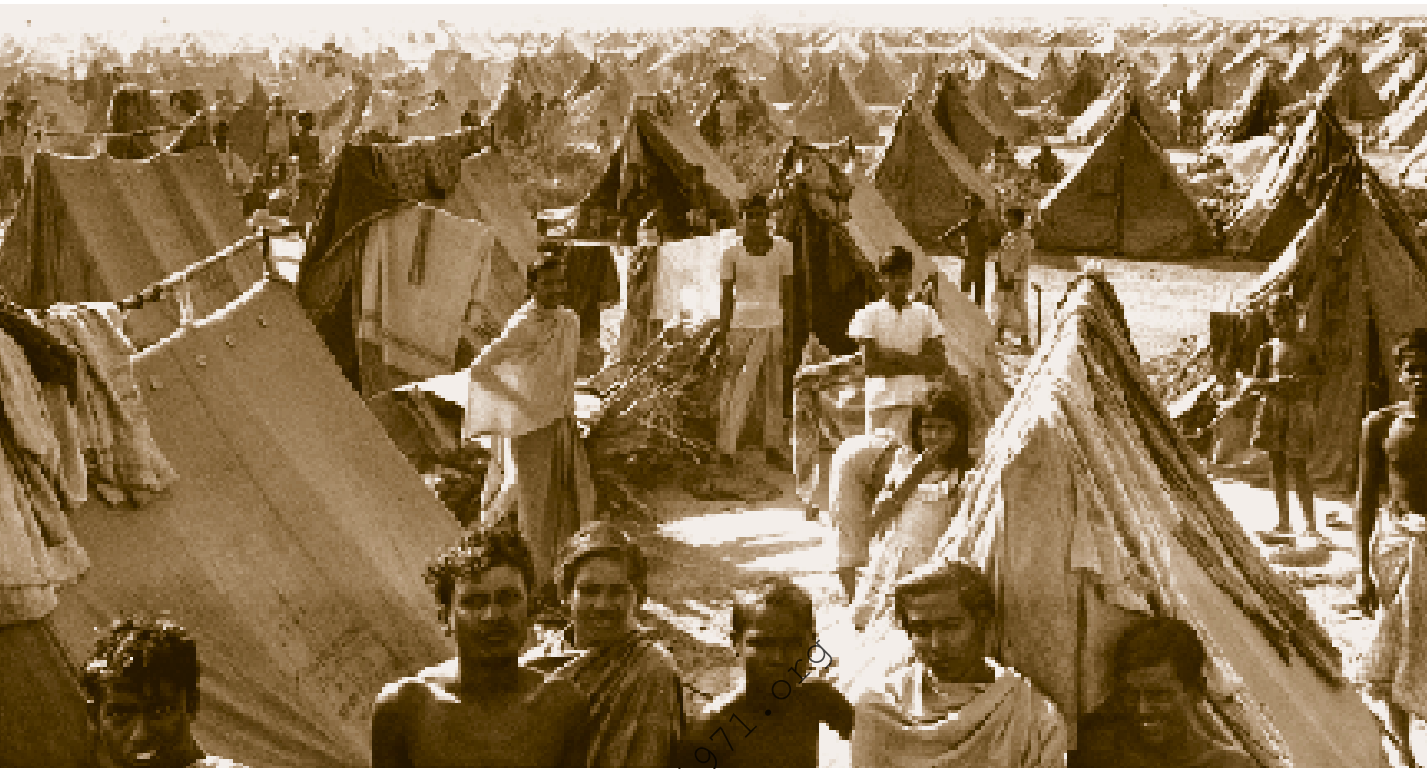
The millions of Bengali refugees who fled to India in 1971 were accommodated in some 800 camps. There were serious outbreaks of cholera in some camps due to the crowded conditions.

Increasingly, the government realized that it would need international assistance to cope with the massive refugee influx. On 23 April 1971, the Permanent Representative of India at the United Nations, Samar Sen, in a meeting with the UN Secretary-General, U Thant, requested international aid. 4 With growing international demands for assistance for the refugees, High Commissioner Sadrudin Aga Khan met with Secretary-General U Thant in the Swiss capital, Bern, on 26–27 April to discuss the situation. Two days later, the Secretary-General decided that UNHCR should act as the ‘Focal Point’ for the coordination of all UN assistance. For the first time in a humanitarian crisis, UNHCR was entrusted with the role of general coordinator.